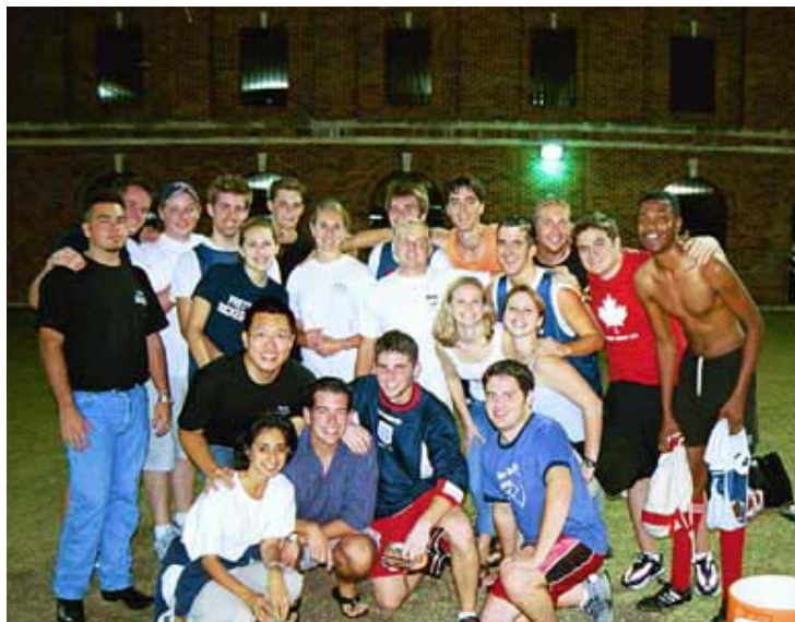
The SigEps celebrate a soccer victory.