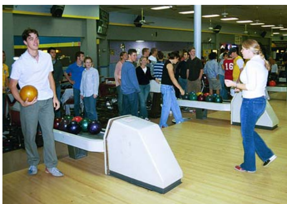
SigEps and Kappa Kappa Gamma Sorority enjoy a night of bowling.

SigEp believes in a Sound Mind and a Sound Body. To encourage a Sound Body, the SMU chapter of SigEp participates in ALL intramural sports. The SigEp intramural teams focus on not only winning, but on practicing good sportsmanship. Some sports include: softball, football, soccer, tennis, basketball, racquetball, billiards, volleyball, and dodge ball. All members participate in some intramural sport. Brotherhood is also developed through support for the intramural teams. SigEp intramural games often bring groups of brothers and friends to support the team.